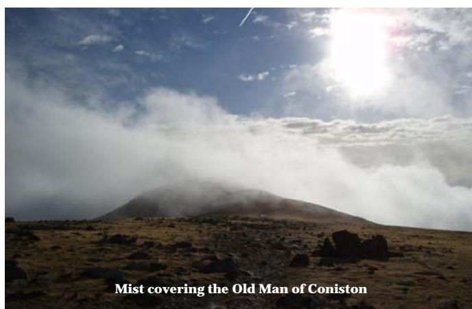
Mist covering the Old Man of Coniston

The January meet was held at the Coniston Coppermines Hut in the Lake District. The meet was stewarded by the Kerr'nol, and in true military fashion we were all rounded up on Friday night and stuffed into transport. The weather for the weekend looked stormy for late Saturday but we didn't care because we knew we'd have a great time! We awoke on sat morning with the sun shining through and a glorious day ahead in the surrounding hills. The old mountain men picked a circular route starting with Wetherlam, looping round to the Old Man of Coniston and returning to the hut. The mere mortals followed with a smaller route, the aim being to get back before the weather broke. We all had a great day and beat the weather (see pic).